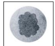
"Cross Section of Swaged Sleeve"